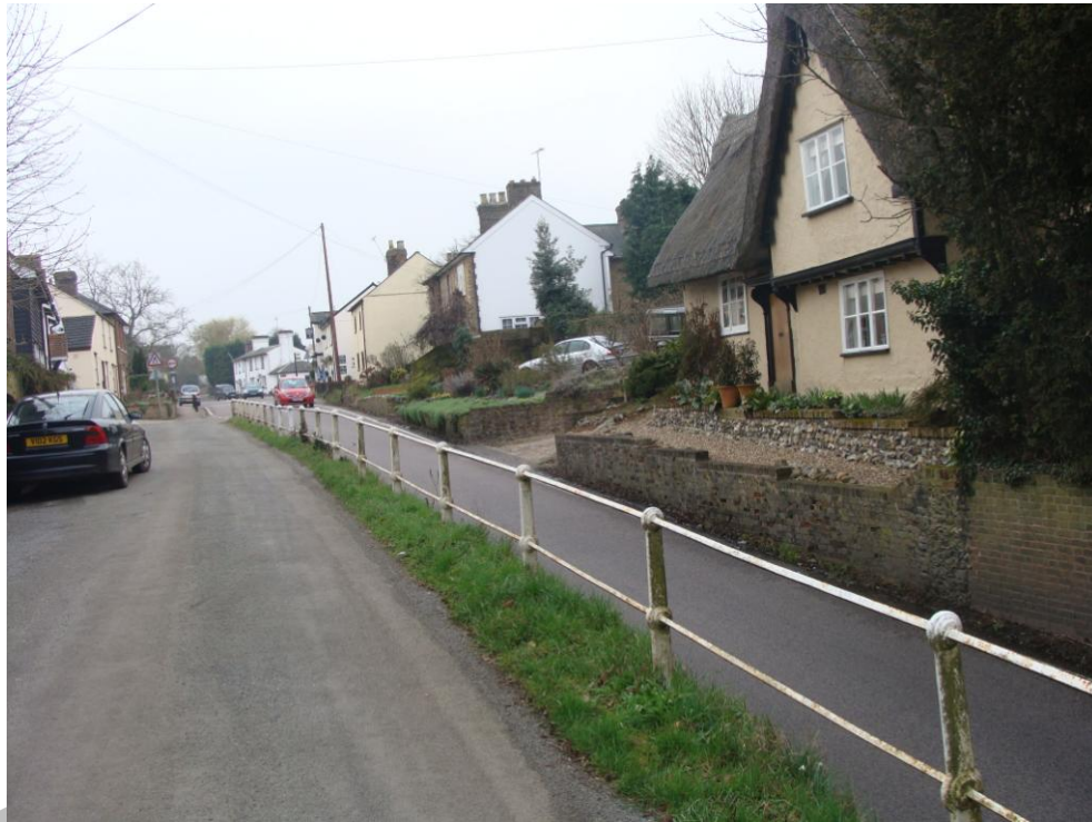
Picture 8 – Distinctive 19/20 th century railings in need of repainting. See also Picture 1. Also photo shows thatched roof, an important characteristic to be retained.

6.56. Other distinctive features that make an important architectural or historic contribution. Distinctive 19 th /early 20 th century metal railings forming boundary with road, south east end of High Street. The horizontal metal bars are supported by sturdy metal supports, pleasantly but simply constructed with rounded detailing. Less than a 1 m in height these railings are technically unprotected in law, but it is understood they are owned by Hertfordshire County Council, a responsible statutory undertaker. They need repainting.