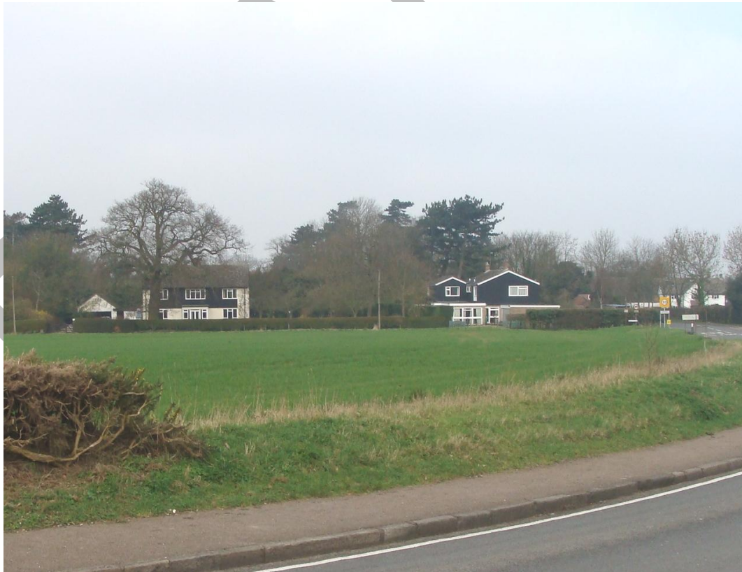
Picture 9 – Properties at 7.1(b) above proposed to be excluded from the Conservation Area.

(b) Home Field House, The Coppice and Little Goddards corner of Abbots Lane and Hunsdon Road is excluded.