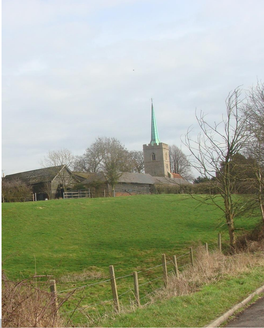
Picture 4 – 19 th century barns considered to be ‘At Risk’ at Widfordbury Farm.

6.8. Within the curtilage of the former Rectory referred to above and similarly protected by its listing status, is a modest 19 th century outbuilding worthy of retention. This is single storey, of brick construction with hipped slate roof and 2 no. semi circular windows to west elevation.