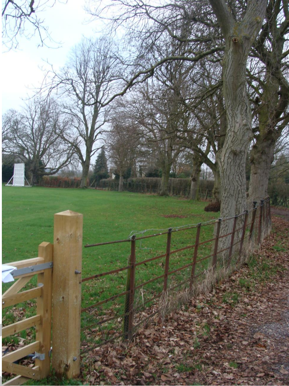
Picture 5 – Cricket Ground, quintessentially English. Railings are in need of repair.

6.29. Particularly important trees and hedgerows. These are at varying stages of maturity, of different types but essentially all performing the task of defining existing boundaries and providing a pleasant and verdant environment, particularly for pedestrians using the footpath and persons participating in sporting activities. Those trees on the circular perimeter of the cricket pitch are particularly noteworthy for their contribution to the local scene.