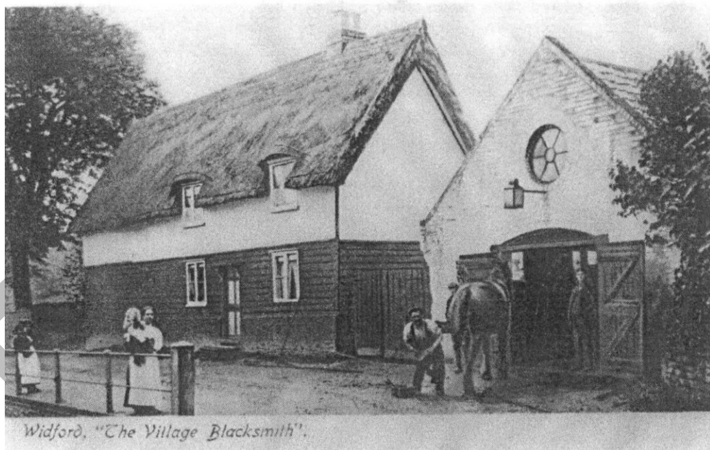
Picture 1 - Widford Smithy, probably early 20 th century (Reproduced courtesy of Hertfordshire Archives and Records).

3.8. The early Ordnance Survey map dating from 1874 shows that the settlement pattern and road layout were very similar to those of today. In addition to the several pumps, pounds, wells, springs and troughs that were shown, a Smithy existed on the eastern side of the High Street and a Post Office at the junction of Hunsdon Road and Bell Lane. Interestingly this map shows allotment gardens to the south of Nether Street, no longer in evidence. Greater tree cover existed at this time. A map dating from 1897 showed there were then two Smithies in the village. Another map dating from the 1920's indicates a single Smithy only, shows the cricket field boundaries in their current configuration and indicates Allotment Gardens on the site of what is now the Lower Croft repair workshop. A map dating from 1963 indicates a Nursery with two large glass houses to the west of the High Street. By the 1960's, the small estates at Bell Lane, Lamb's Gardens and Benningfield Road had been built.