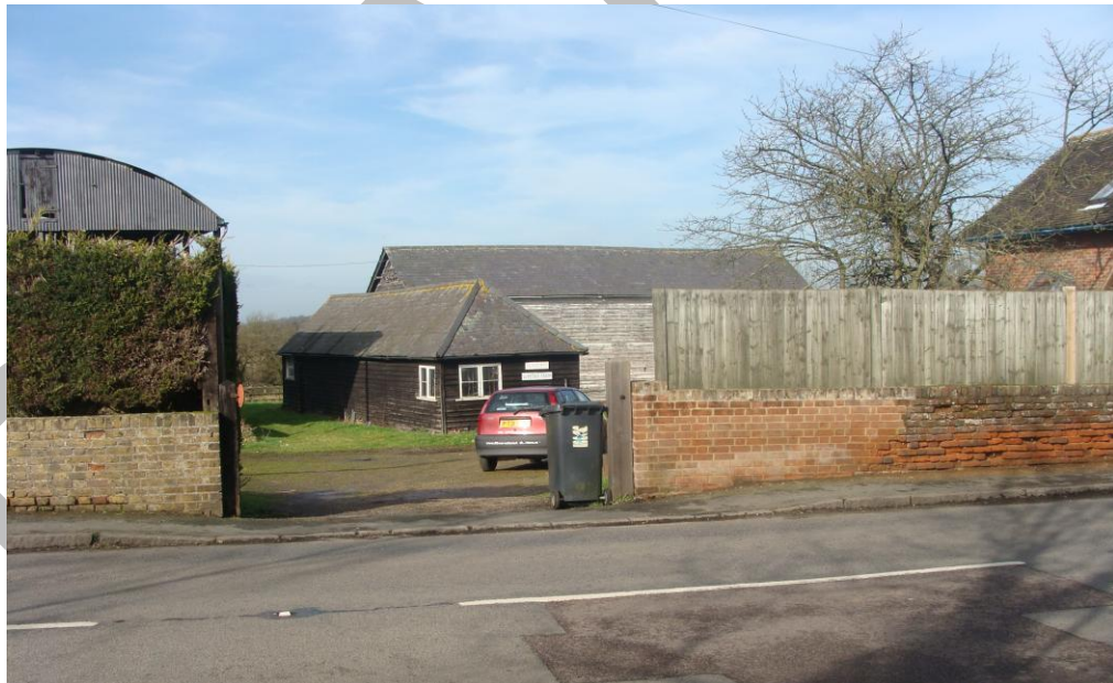
Picture 7 – 19/20 th century barns at White's Farm. Wall to front in need of repair. Dutch Barn and fence detract.

6.54. Elsewhere at the White's Farm site on Ware Road are an interesting group of buildings dating from the late 19 th /early 20 th century. The residence to the front is two storey, tiled roof with central chimney and decorative wooden barge board to front. To the rear is a group of farm buildings probably dating from the same period being weather boarded agricultural barns of varying heights and slate roofs, one with tall prominent agricultural door. Access to the site could not be obtained so their location and the description provided is limited to visual observations from the street.